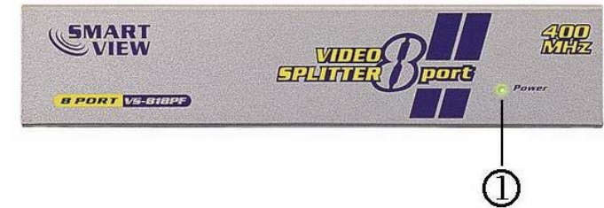
1. Power LED