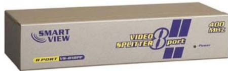
(VS-818PF) 1 In 8 Out