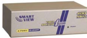
(VS-814PF) 1 In 4 Out