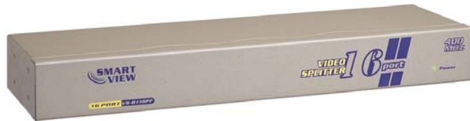
(VS-8116PF) 1 In 16 Out