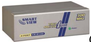
(VS-814H) 1 In 4 Out