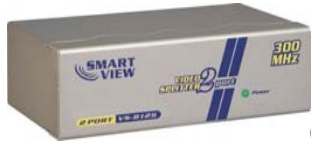
(VS-812H) 1 In 2 Out