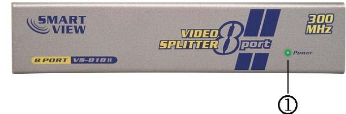
1. Power LED