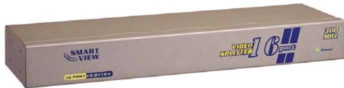
(VS-8116H) 1 In 16 Out