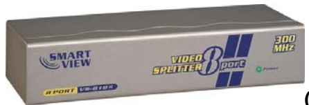
(VS-818H) 1 In 8 Out